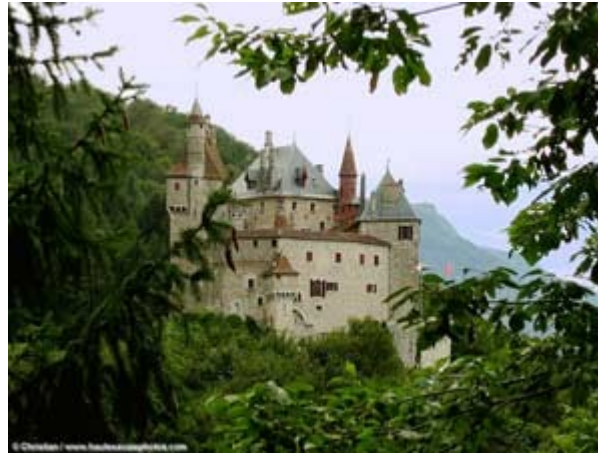
Château de Menton