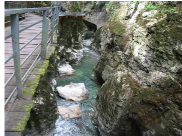
Gorges du Fier