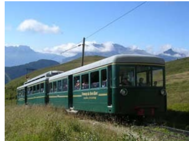
St Gervais, Tramway du Mont-Blanc