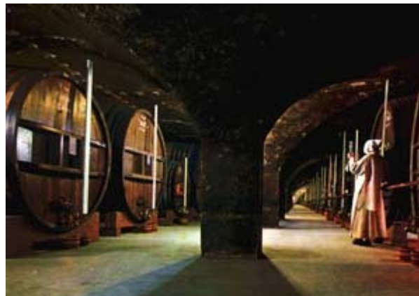
Caves à liqueur Grande Chartreuse